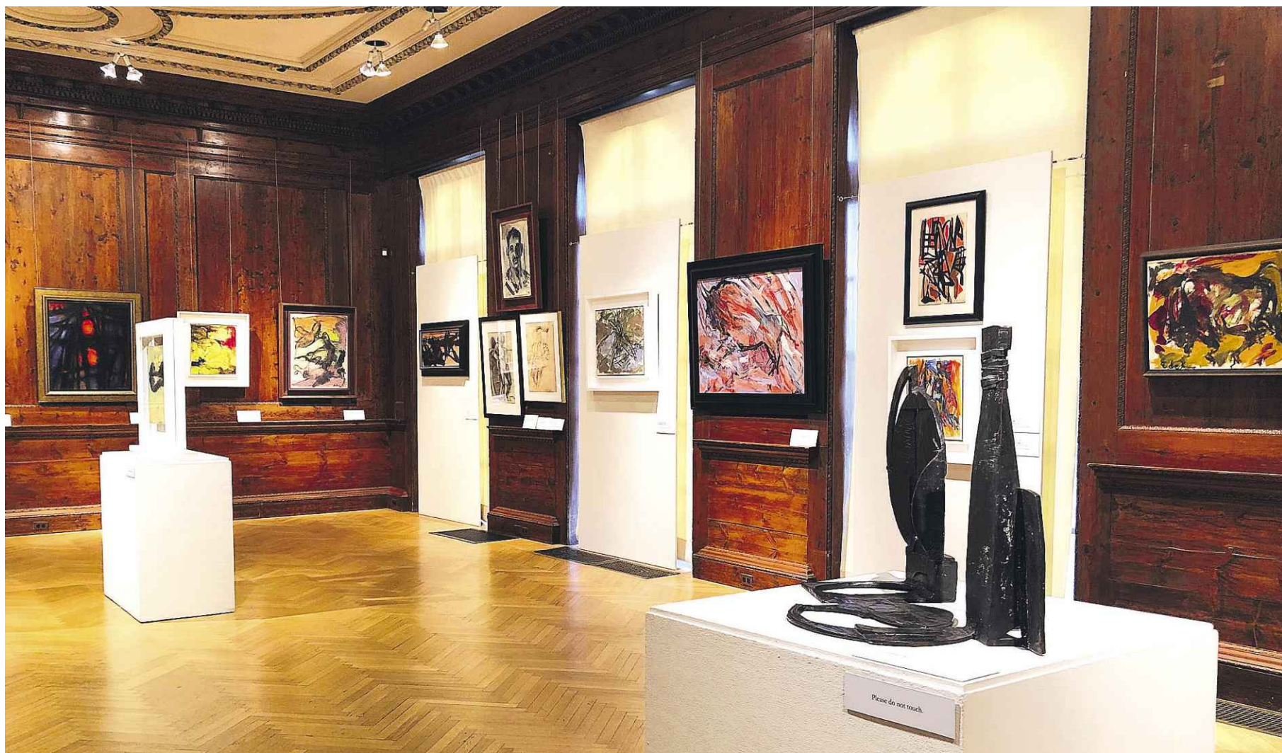
NASSAU COUNTY MUSEUM OF ART

Audrey Flack speaks about women artists newsday.com/museums